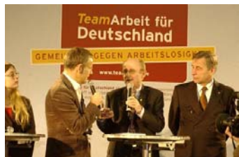
Reinhold Beckmann speaking with Willy Lemke and Wolfgang Clement