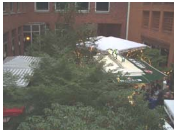
This is what it should look on August 26

After the great success of the WTC Tenant Sommerfest last year, plans are already in the works for another get-together this summer. It is scheduled for August 26, 2004. An extra invitation will be sent to all the tenants of the WTC as the date nears.