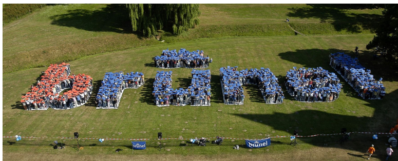
Brunel staff create a 'human logo'